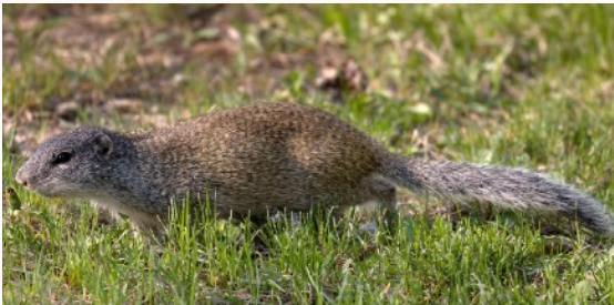
Franklin's ground squirrel