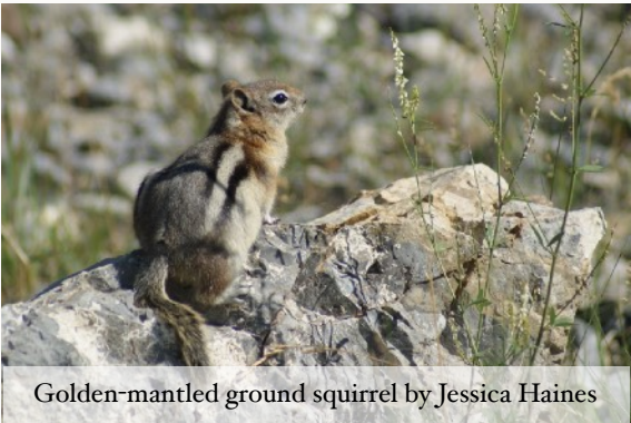
Golden-mantled ground squirrel

Some squirrels may be endangered and you can help us learn more about them - read more on the right side of this page. But looking for squirrels is also a great way to explore the outdoors - they live in lots of different places and some are active all year. They have a lot of personality and are fun to watch!