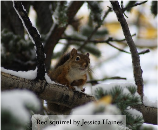
Red squirrel