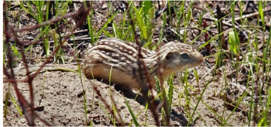
Thirteen-lined ground squirrel