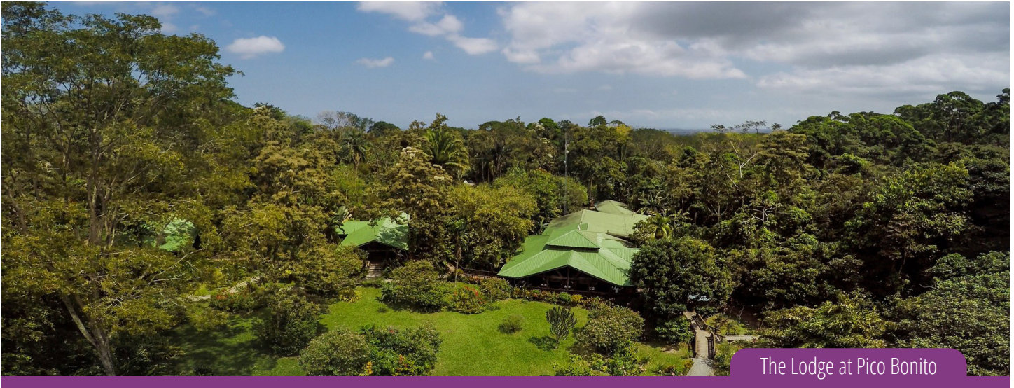
The Lodge at Pico Bonito