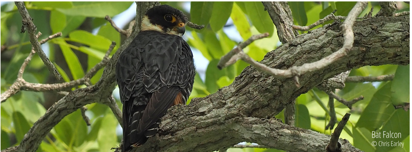
Bat Falcon